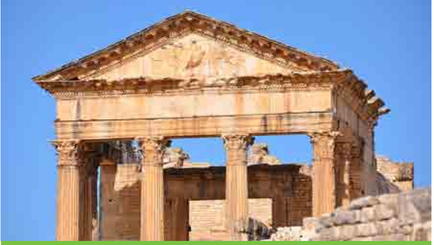
The Capitol in Dougga, Tunisia

The concept of the democratic `forum' has a very long history in Tunisia. In ancient Rome the forum was a space at the heart of a city, dominated by the Capitol (temple), where public discussions were held. It is an important part of the architectural heritage of Tunisia, exemplified by the Roman ruins of the Capitol in Dougga, which are perched atop an ancient Roman forum.